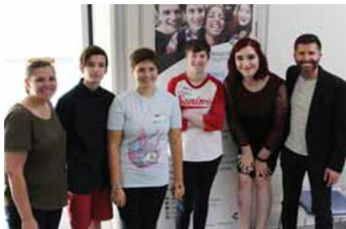
201 Youth First members