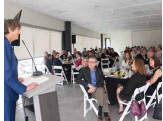
Vison of Equality fundraising luncheon