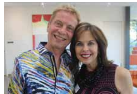
Get Centered tours