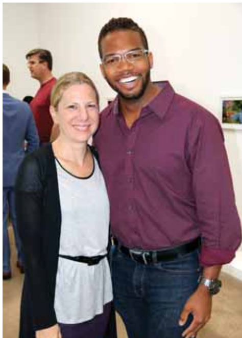
Young Professionals gather in support of Youth First

Visit myresourcecenter.org/calendar for a full list of programs and events